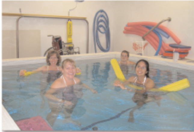
The P/SL therapy pool: a great place to relax and make new friends.

out of my room and meet others in the ante-partum wing.